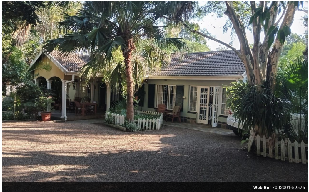
Web Ref 7002001-59576